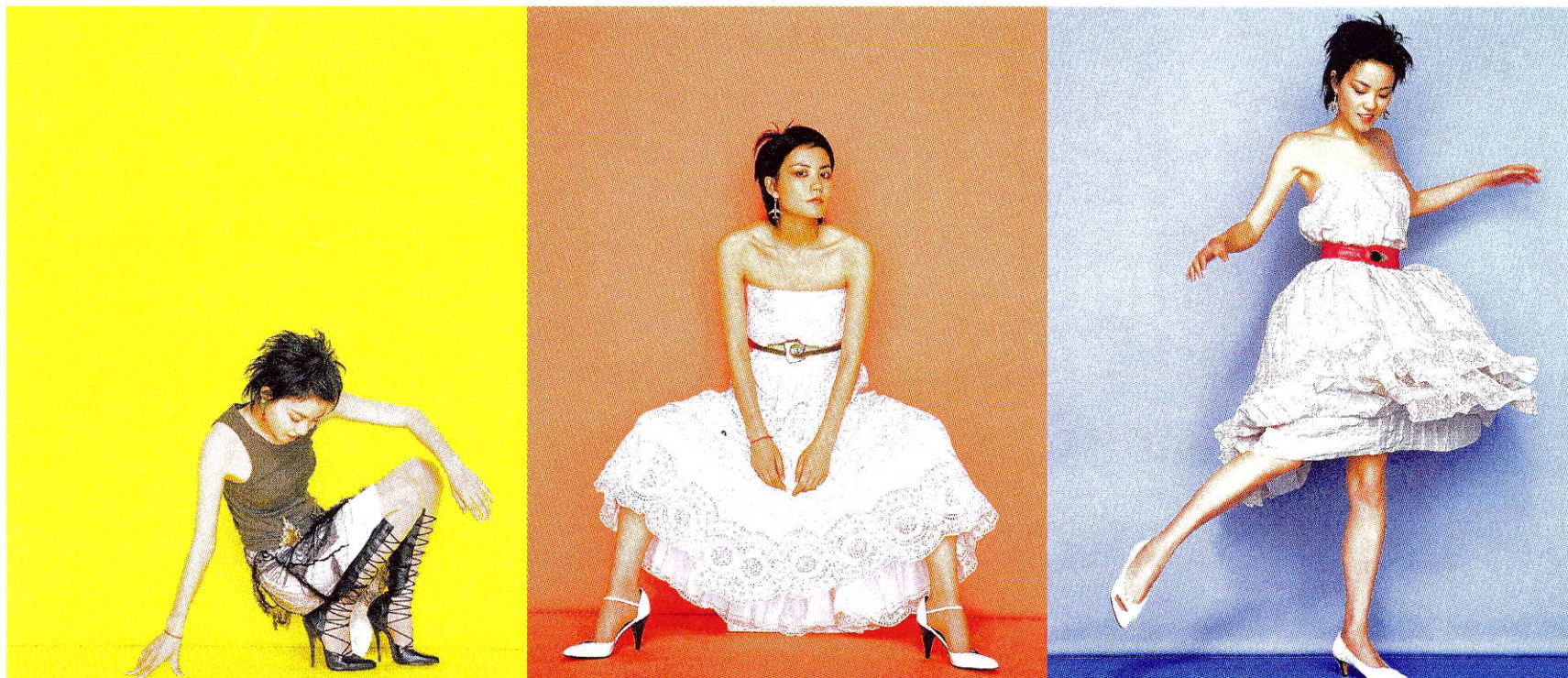
Faye Wong, you will only go on to greater heights, so please don't quit.